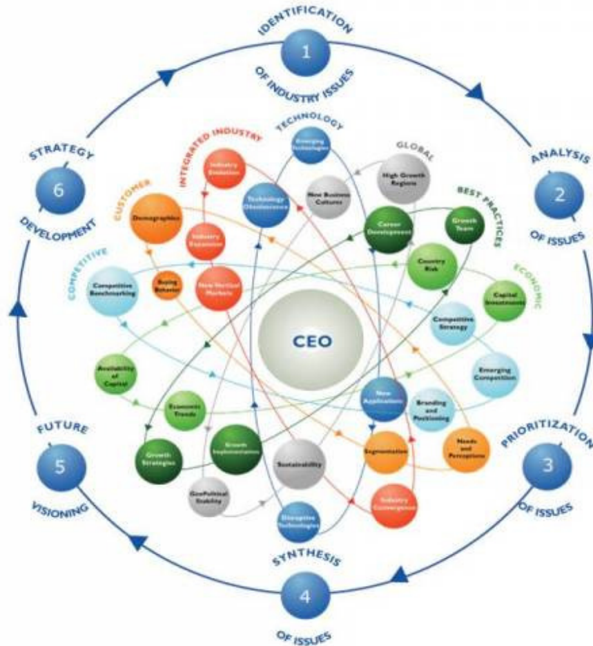
Chart 5: The CEO's 360-Degree Perspective™ Model