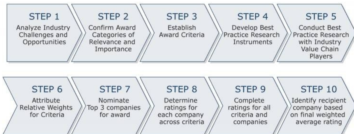
Chart 3: Frost & Sullivan’s 10-Step Process for Identifying Award Recipients

This exercise encompasses all criteria, leading to a weighted average ranking of each company. Researchers can then easily identify the company with the highest ranking. As a final step, the research team confirms the veracity of the model by ensuring that small changes to the ratings for a specific criterion do not lead to a significant change in the overall relative rankings of the companies.