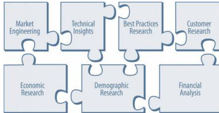
Chart 6: Benchmarking Performance with TEAM Research